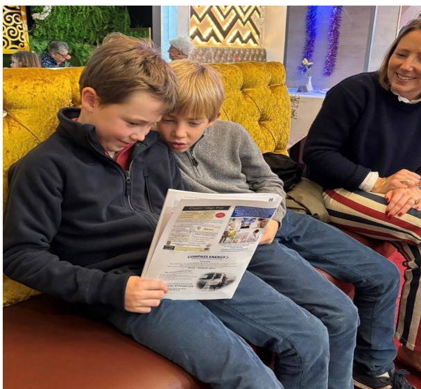
Two children enjoying the challenge of Village Link's Christmas puzzle page whilst waiting for food at The Jomidar in Creaton.