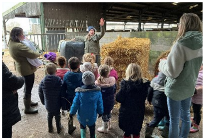
The Nativity (left) and Farm Visit (above)