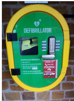
Defib cabinet showing bleed kit label

Access to the Bleed Kit is the same process as the Defibrillator - via 999 to the Ambulance service, who will provide the Cabinet Lock code and advise on use.