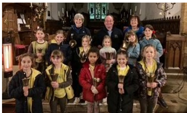
Guilsborough Brownies Ringing The Hand Bells