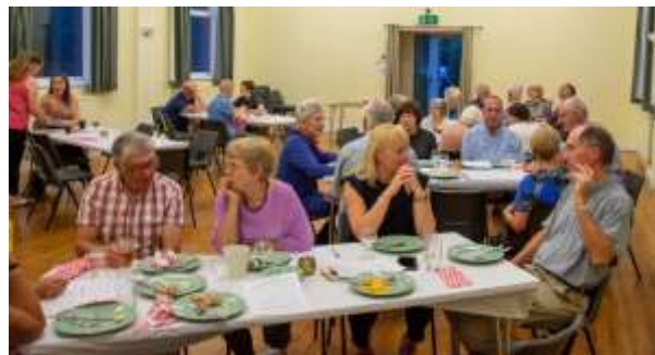
Food and chat at the Shop's First Birthday Party for the volunteers