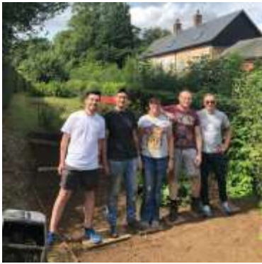
A team (pictured left) from Nationwide's Northampton office recently donated their time to help Guilsborough Preschool with its new 'Secret Garden'. They dug and bordered the growing areas and fire pit complete with tree stump seating and made a compost heap. The Witch and Sow pub also generously donated some tables and seating from their garden. Full story on page 11.