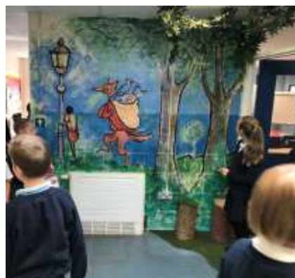
The new art in school

See P12 for details of the Primary School Open Days in November