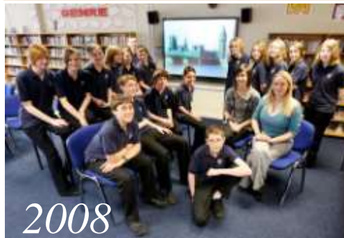
Students today compared with students when the school opened